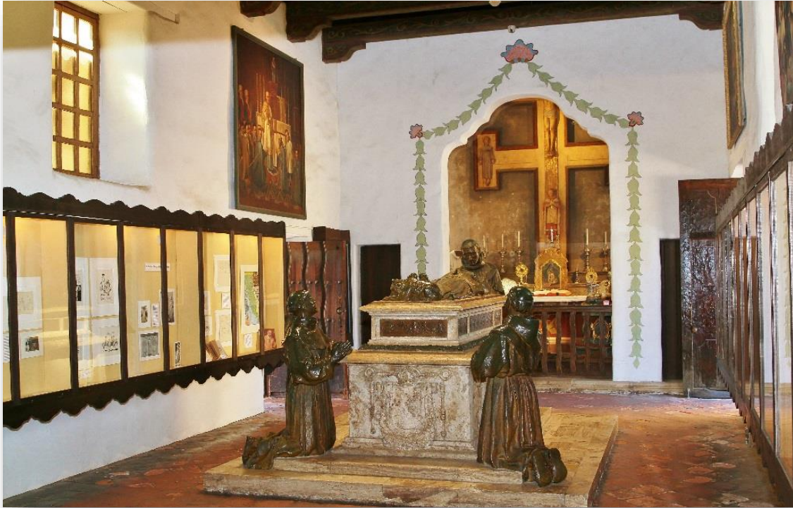
Cenotaph and interior of the Mora Chapel Museum

The Mora Chapel Museum is slated for seismic stabilization, new sprinklers, accessibility upgrades, and general renovations. The display cases lining the long north wall will be replaced with conservation-grade cases in a similar configuration. These cases will house future rotating exhibits. The exhibit cases along the south wall will be removed to allow an accessible circulation path from one side of the room to the other. A second visitor exit on the east side of the south wall will also be provided. Exhibit treatment along the south wall will be displays that do not protrude too far out from the walls. The exhibits will interpret Jo Mora's story, Harry Downie's story, and the general concept of the lure and mystique of the missions that sparked the restoration movement.