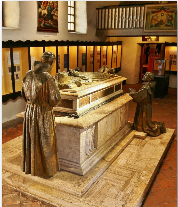
Junípero Serra Cenotaph